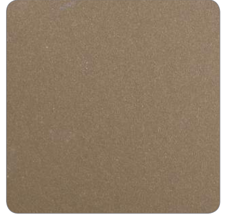
Y2206F Steel Bronze 1