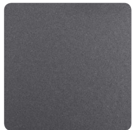
Y2207I Steel Blue Platinum