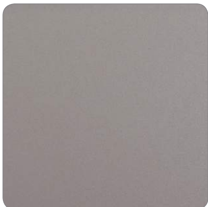
Y2204I Soft Champagne