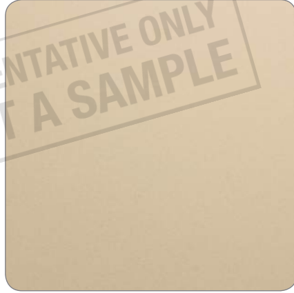
YW255F Golden Beach