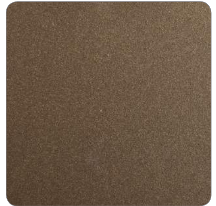
Y2217F Steel Bronze 2