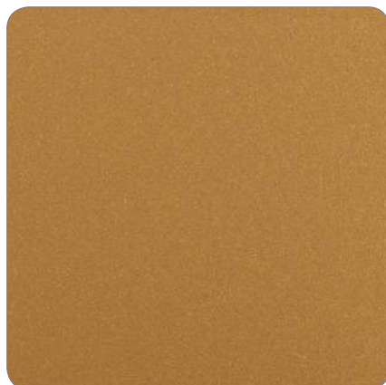
Y2205I Gold Splendour