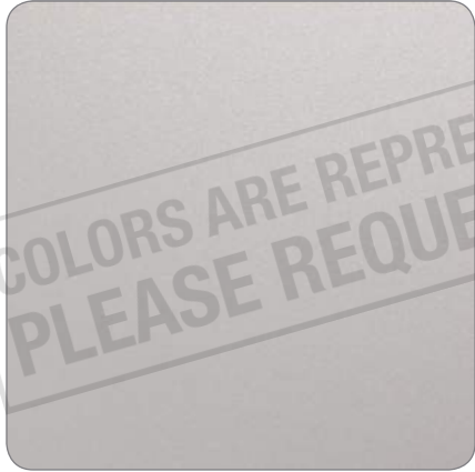
YW201E Anodic Ice

COLORS ARE REPRESENTATIVE ONLY PLEASE REQUEST A SAMPLE