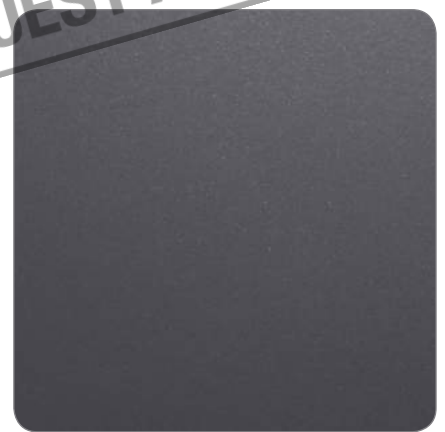
Y2215F Steel Blue Gray 715