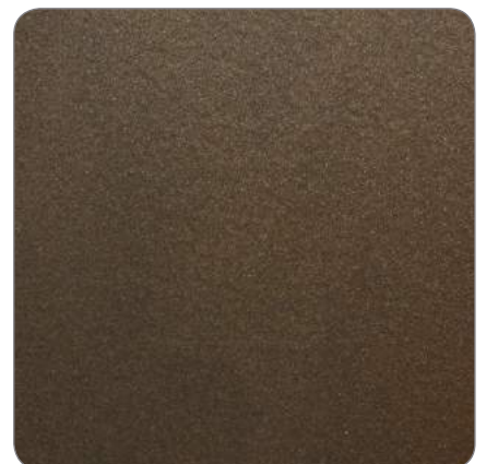
Y2214F Anodic Bronze