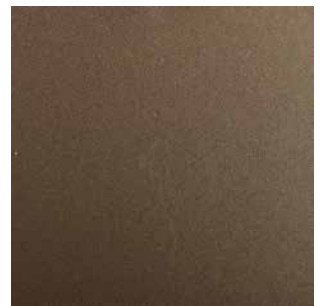
Steel Bronze 2 Y2217F