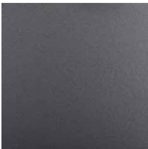
Steel Blue Platinum Y2207I