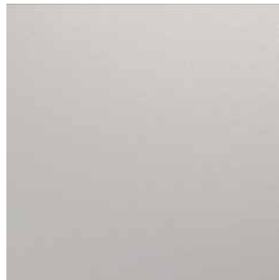
Anodic Ice YW201E