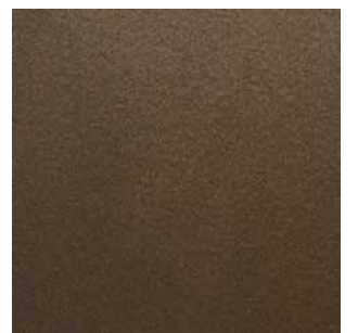
Anodic Bronze Y2214F