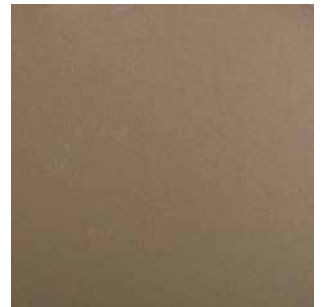
Steel Bronze 1 Y2206F